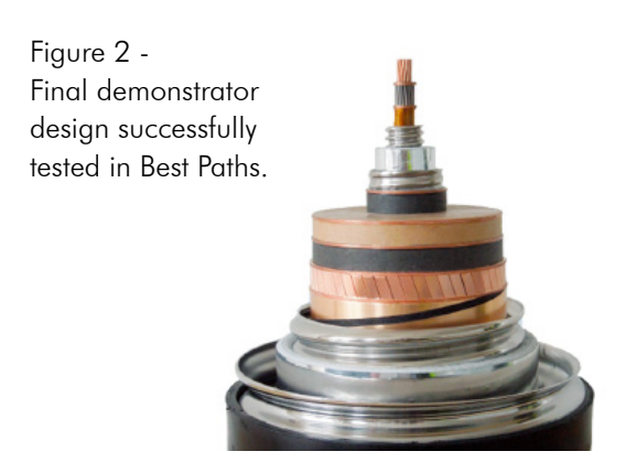
Figure 2 shows the final design.

Although operating at 320 kV, the HVDC superconductor cable system was tested at nearly 600 kV to meet Cigré recommendations. Future development could include reducing the operating voltage to keep the cable's overall diameter to a minimum while minimizing its footprint. The current would then be increased correspondingly to maintain the GW power levels.